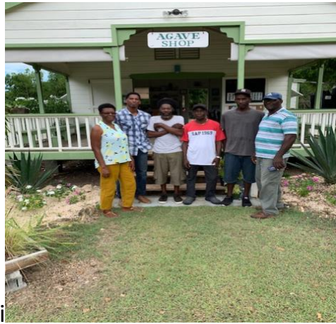
Development Institute, Cardi

Our first meeting in November we introduced a new liaison with Caribbean Agricultural Research and