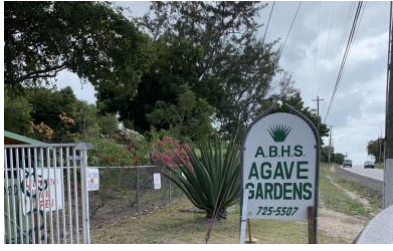
Our newly erected sign.

Our first meeting in November we introduced a new liaison with Caribbean Agricultural Research and